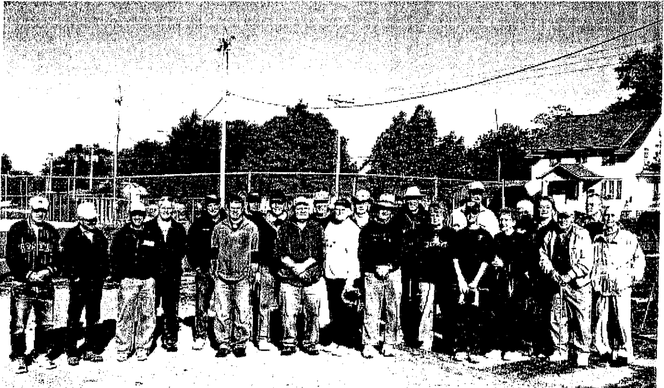
City Courts, Eldora, Iowa, September 15, 2007