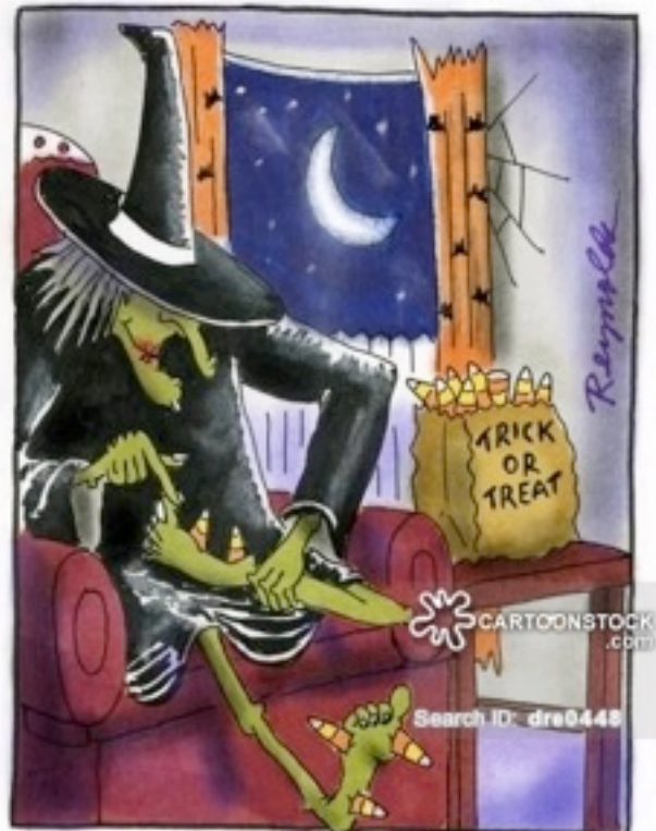
Where candy corn comes from...

From the Editor: Please submit your articles, suggestions, recipes, shoe-trader information, tournament results, etc. to me by E-mail at ddand2dogs@msn.com or mail to my home address at 1306 NW Greenwood St., Ankeny, IA 50023. Or you can call me at 515/778-5932. The next issue will be February 1, 2015, so please submit by January 20th.