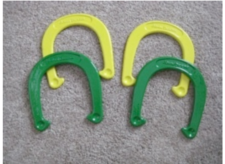
2009 St. Pierre John Deere Shoes out of the Royal mold

Sometime after that while searching for John Deere horseshoes online, I found an EBay sale where two sets of John Deere horseshoes, two stakes and a rule book along with the original box had been sold. Details of the sale said the horseshoes were purchased from St Pierre back in 1992. The lid on the box indicated that they were a John Deere Grand Detour Horseshoe set. I copied the photo from the Ebay website and sent it to St Pierre asking if it was in fact a horseshoe set they had made. This time the reply I got was yes, that they did make that set back during that time frame but they had no pictures of them. From the website photo they looked like American shoes, but the photo was so small it was difficult to be sure. Photos of the St. Pierre John Deere horseshoes are shown below.