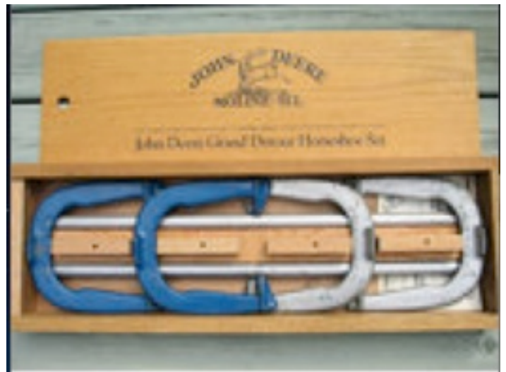
1992 St. Pierre John Deere Grand Detour Horseshoe Set