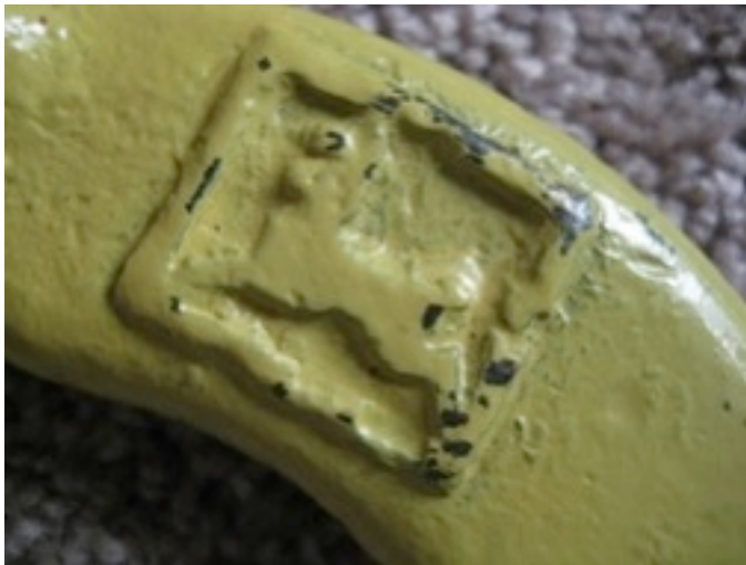
Close up of John Deere Logo 1969