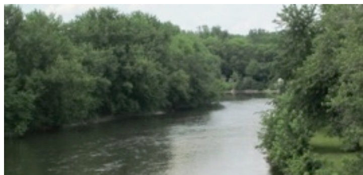
View of the Cedar River from Charley Western Trail bridge