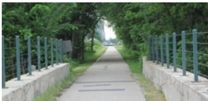
The Charley Western Bicycle Trail next to the Leo Marth Courts