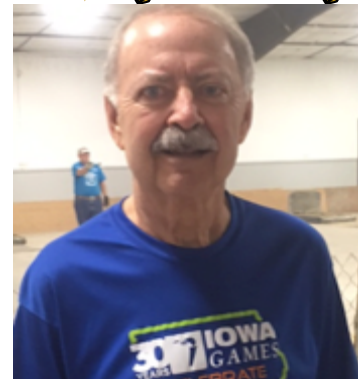
IHHPA MEMBER WINS IN FLORIDA